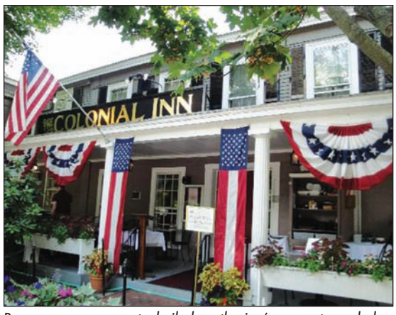
and destroy the supplies, Because arms were stockpiled on the inn's property and elsethe local Minutemen met where in town, the British sent troops to Concord in 1775 them at the North Bridge on April 19 for what would become the first battle

In 1775, one of the inn's original buildings was used as a storehouse for arms and provisions. When the British came to seize and destroy the supplies, Ethe local Minutemen met withem at the North Bridge on of the American Revolution.